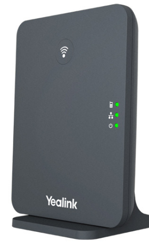
Yealink DECT IP Base Station W70B